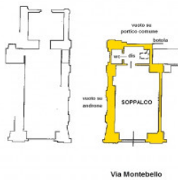
Via Montebello PIANTA PIANO TERRENO SOPPALCATO (2° f.t.) Hm = mt 2,00